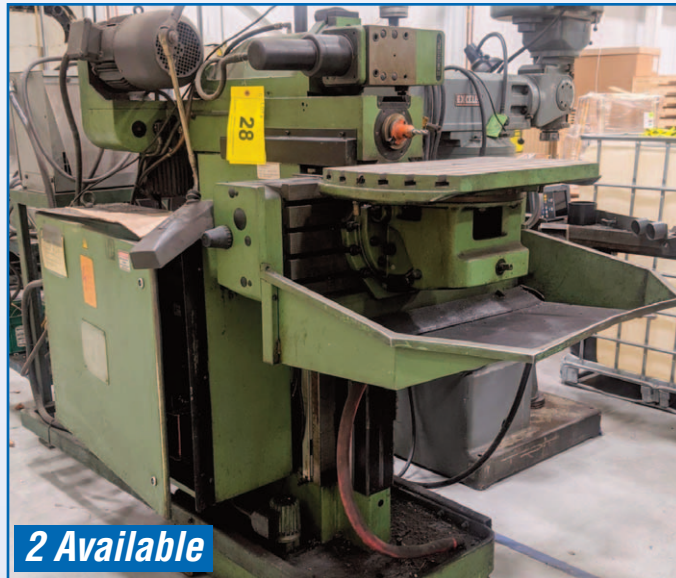
DECKEL FP4M UNIVERSAL MILLING MACHINES