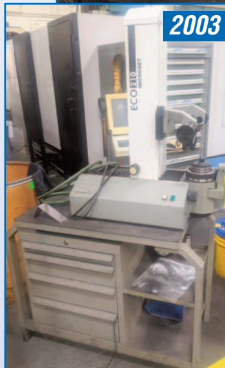
DMG MICROSET ECO II TOOL SETTER

FABMASTER HBM-40 Horizontal NC Hydraulic Bending Machine, 40-Ton Cap., s/n 570050, 575V