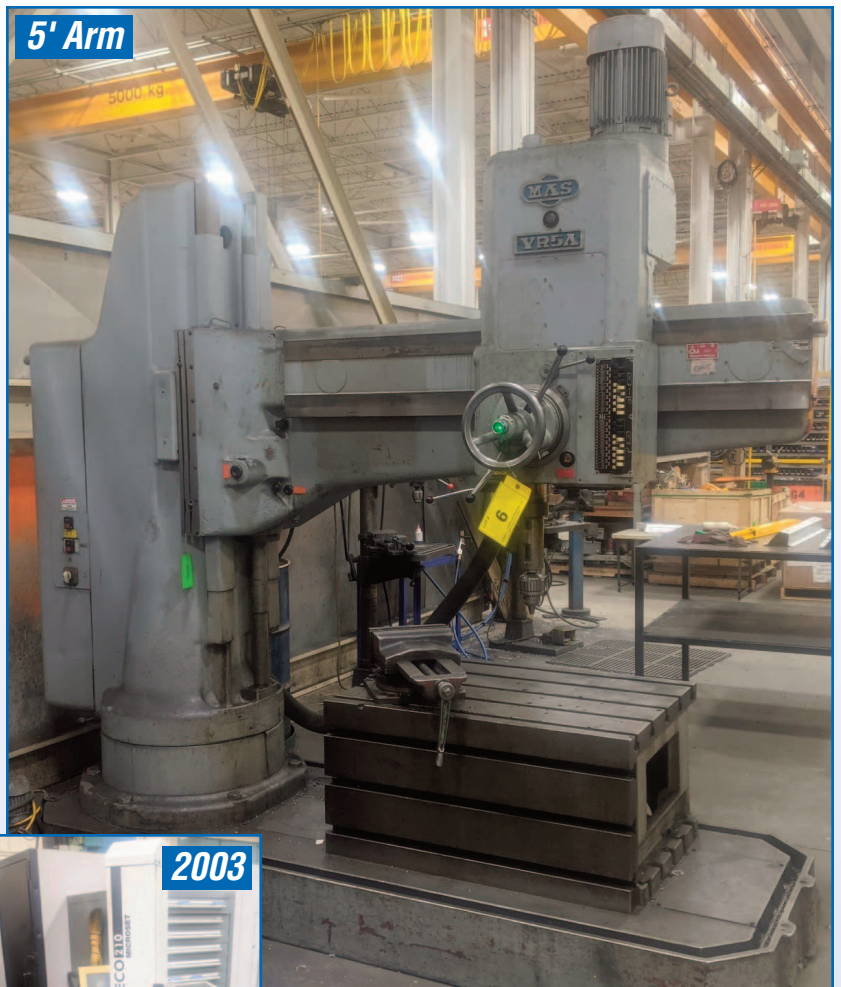
MAS VR5A RADIAL ARM DRILL