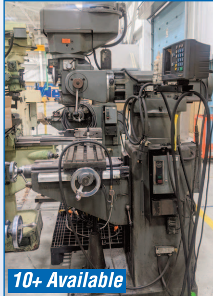
EXCELLO 602 VERTICAL MILLING MACHINES