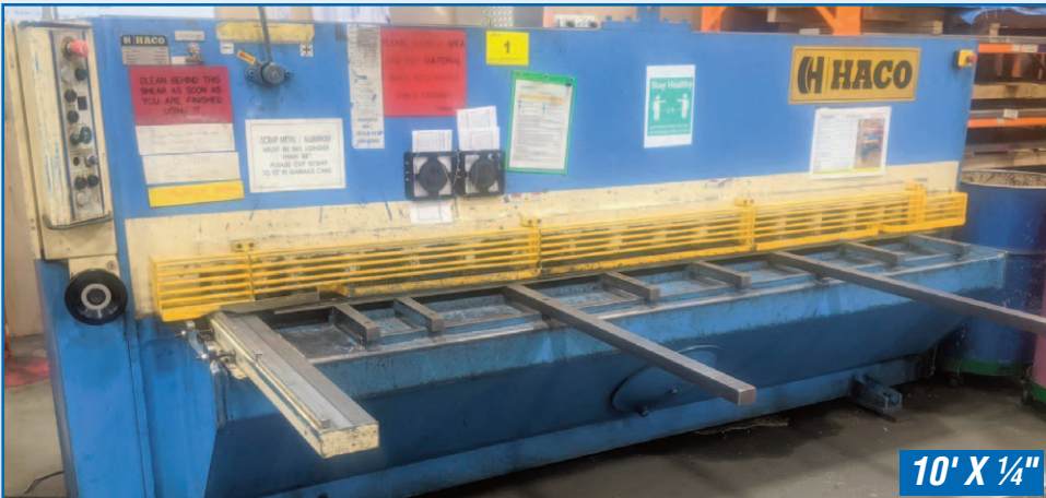
10' X 1/4"

Visit infinityassets.com for complete specs and additional photos