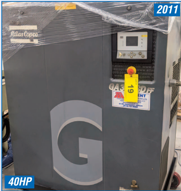
ATLAS COPCO GA30VSD AIR COMPRESSOR