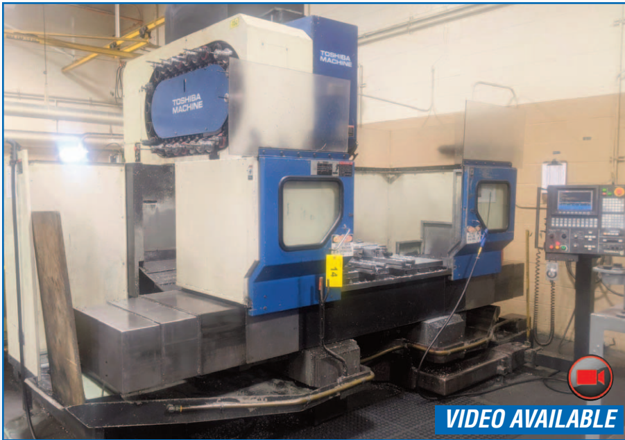
TOSHIBA VMC-550 CNC VERTICAL MACHINING CENTER