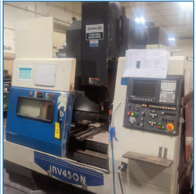
TOSHIBA JRV450N CNC VERTICAL MACHINING CENTER