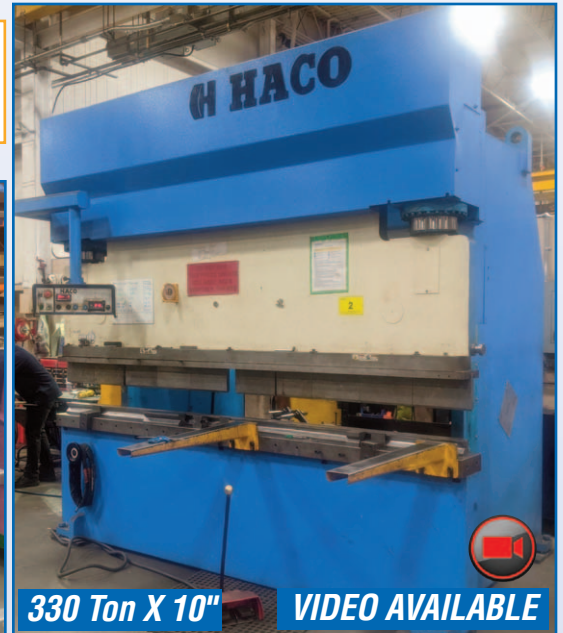
330 Ton X 10"