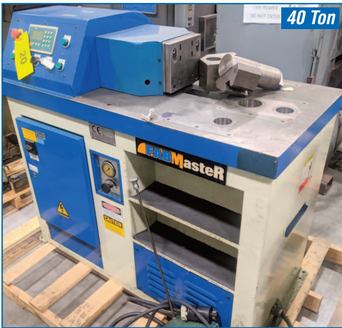
FABMASTER HBM-40 HORIZONTAL NC HYDRAULIC BENDING MACHINE